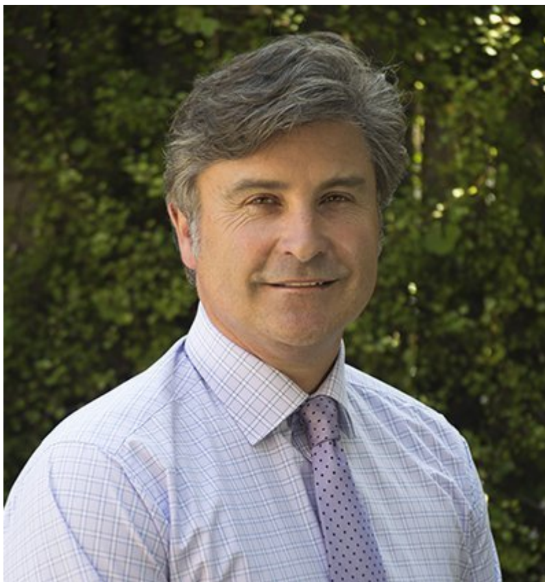
Warrnambool City Council Mayor Tony Herbert.