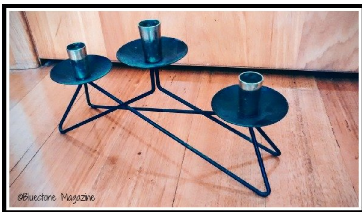
The retro metal candle holder designed for a trio of candles, unearthed at the Uniting Church Op Shop, Cobden, for $4.