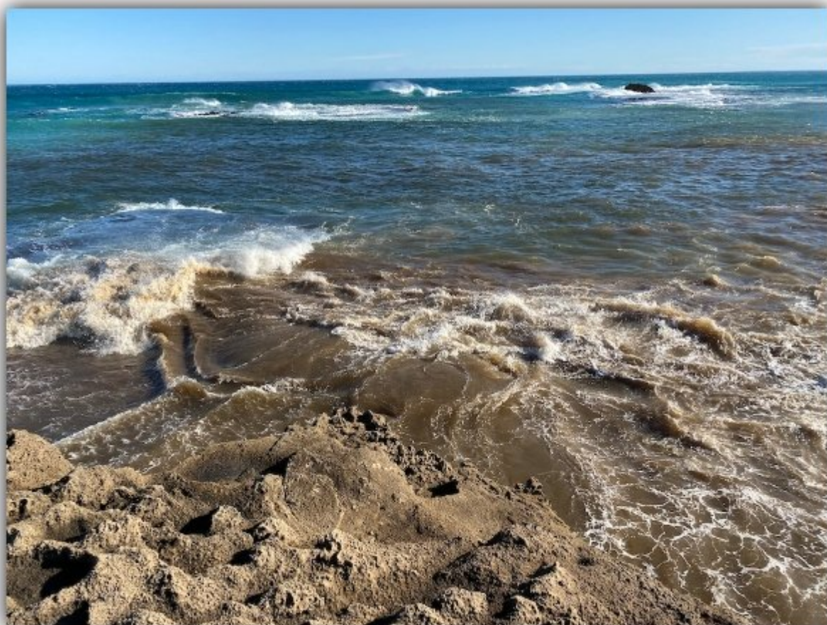
A “dirty dump” of effluent from the Wannon Water treatment plant released off Thunder Point last month.