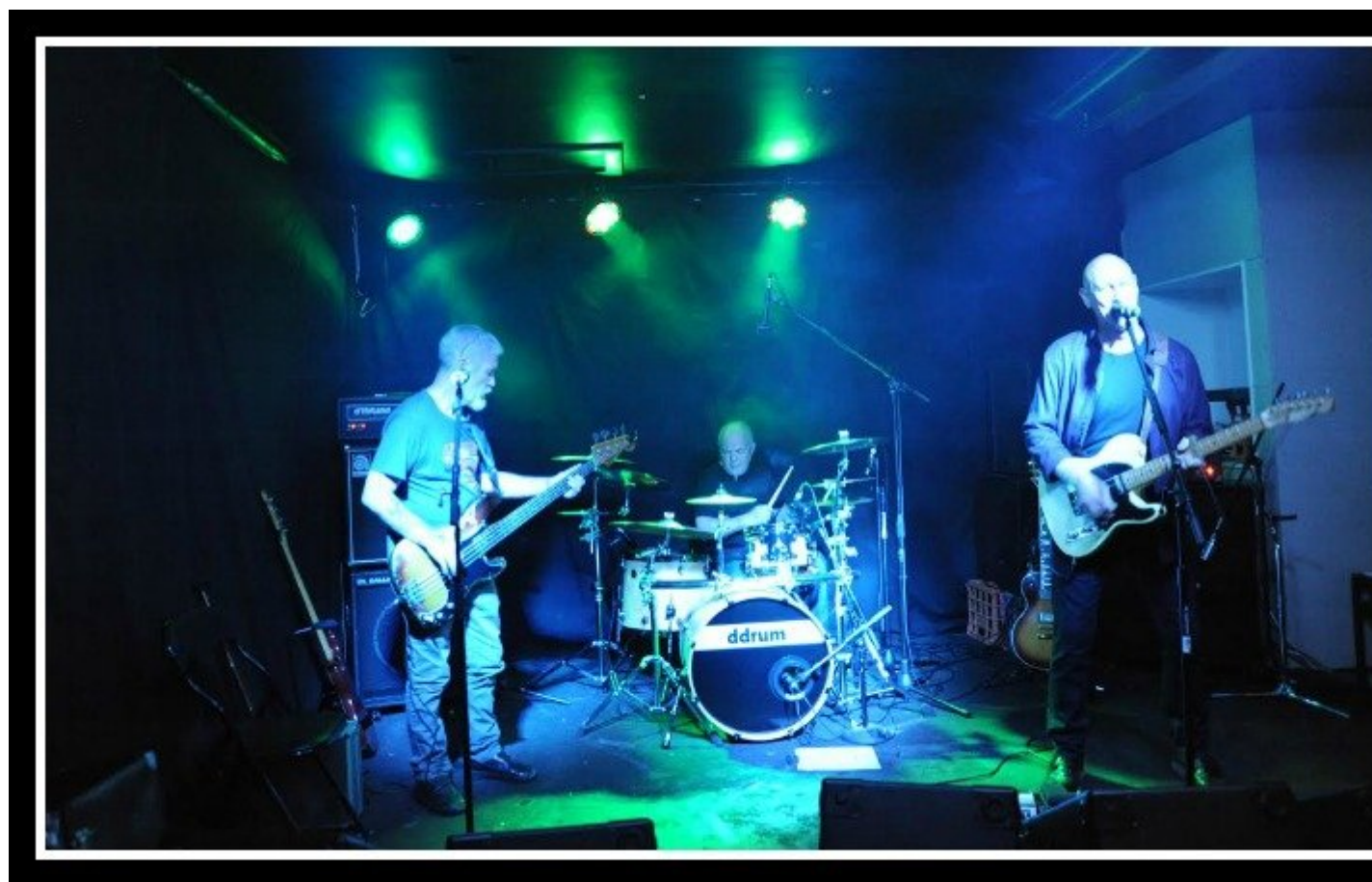
The Sleevehearts are a combination of old friends and talented musicians who now play music for the love of it.

[author] [author_image timthumb='on'] http://www.the-terrier.com.au/wp-content/uploads/2017/03/lee-nicholson-smaller.jpg [/author_image] [author_info]Welcome to Soundcheck : a look at the local live music scene with Lee Nicholson.