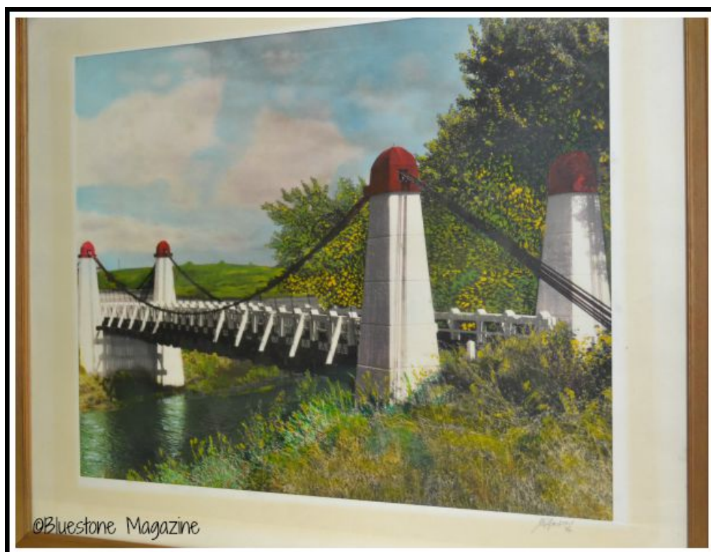
A closer look at the hand-tinted photograph, "Wollaston Bridge" taken by Eva Gaspar in 1976 and purchased by the Warrnambool Art Gallery in 1977.

What a generous, creative soul was Eva Gaspar.