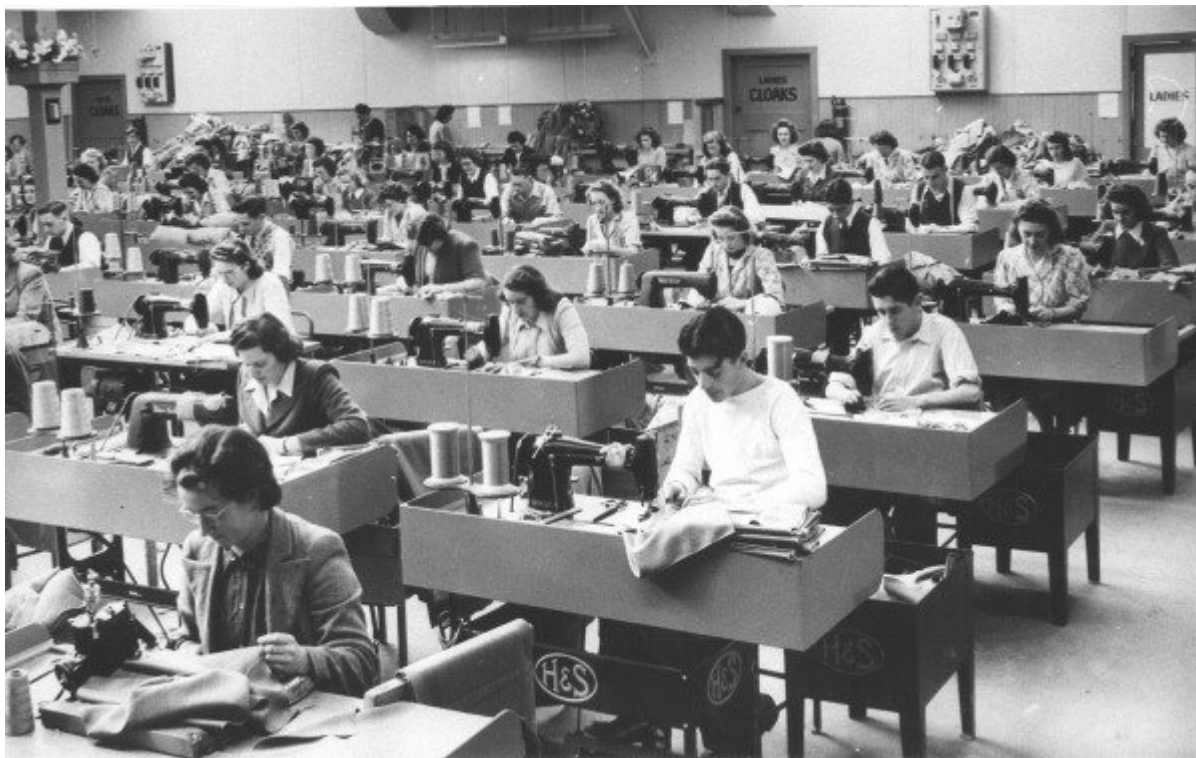
Just one of the wonderful images: Workers in the main sewing room at the then-newly opened Fletcher Jones factory at Pleasant Hill, Warrnambool, in 1948.