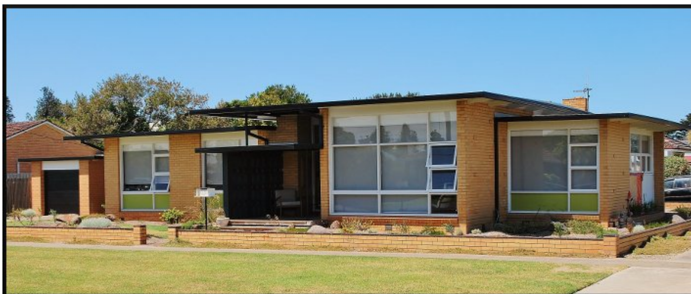
An elegant composition of varying roof heights and window geometries.

With such positive feedback from Bluestone and healthy audience numbers, I decided to jump in the deep end with a forensic investigation into the history of local architectural identity Tag Walter .